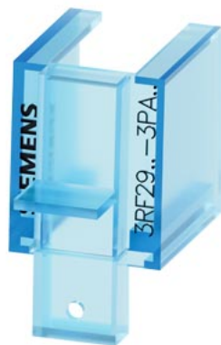
terminal cover for 3RF21/23 ring cable terminal and screw terminal