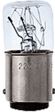
Incandescent lamp, 24 V AC/DC, 5 W, Base BA 15d, accessory for signaling columns, with diameters 50 mm + 70 mm, (Packing unit 10 units)