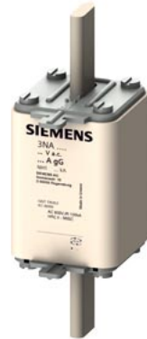
LV HRC fuse element, NH1, In: 200 A, gG, Un AC: 500 V, Un DC: 440 V, Front indicator, live grip lugs