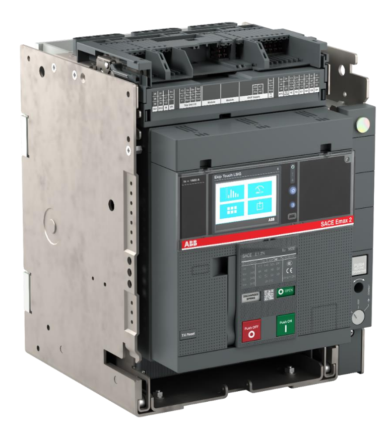
ABB ACB Emax2 E1.2 IEC 1600A (CN) Production site: Xiamen, China May 2023